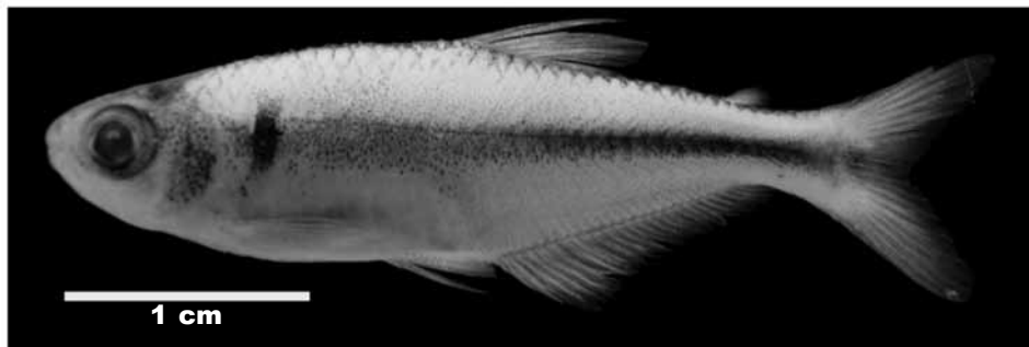
Fig. 1. Bryconamericus macarenae n. sp., holotype: IUQ 2448, 36.2 mm SL. male, Vista Hermosa municipality, La Palestina village, Orinoco River basin, Colombia.

18.9–36.9 SL. La Palestina village, Pringamosal Creek, Blanco River drainage, creek 500 m north of La Palestina School, 3° 03' 15" N, 73° 49' 54" W, 282 m a.s.l., 9 I 2009. IUQ 2559, 2, 40, 6–42, 2 SL. Buenavista village, Creek on the Las Delicias farm, 3° 07' 02" N, 73° 52' 29" W, 469 m a.s.l., 9 IV 2009. IUQ 2560, 9, 26.5–42.2 SL. Buenavista village, Creek on La Prosperidad farm, 3° 07' 09" N, 73° 52' 23" W, 411 m a.s.l., 9 IV 2009. IUQ 2561, 27, 22.9–47.2 SL. Buenavista village, Creek on Las Delicias farm, 20 m from the house 3° 07' 02" N, 73° 52' 20" W, 409 m a.s.l., 9 IV 2009.