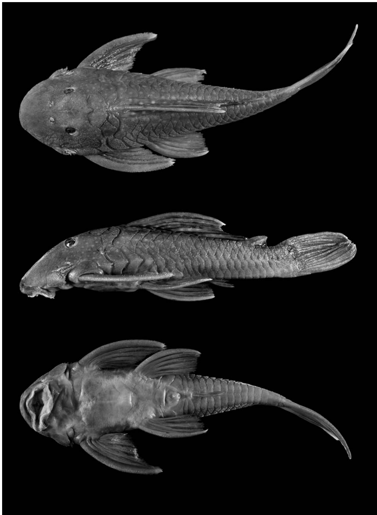
Fig. 2. Baryancistrus demantoides MCNG 54029, 150.5 mm SL; holotype, dorsal, lateral, and ventral views.