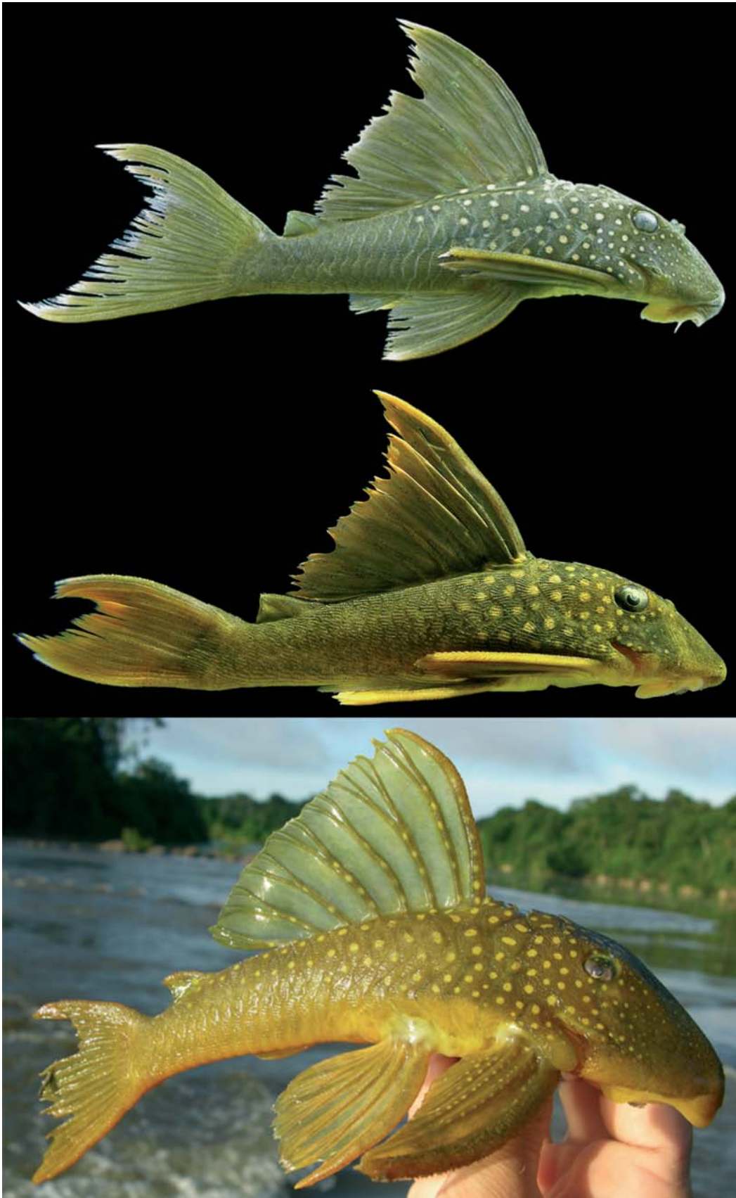
Fig. 1. Live specimens of a: Baryancistrus demantoides , adult, AUM 42034, paratype, 96.3 mm SL; b: B. demantoides , juvenile, MCNG 54031, paratype, 54.1 mm SL; c: Hemiancistrus subviridis , AUM 42933, 146.9 mm SL.